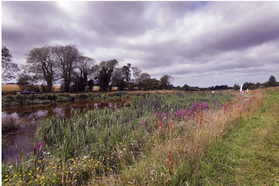
Cover photo - Anglian Water's first wetland treatment site, on the River Ingol in west Norfolk. The wetland has been created in partnership with the Norfolk Rivers Trust and forms part of Anglian Water's Water Industry National Environment Programme (WINEP).